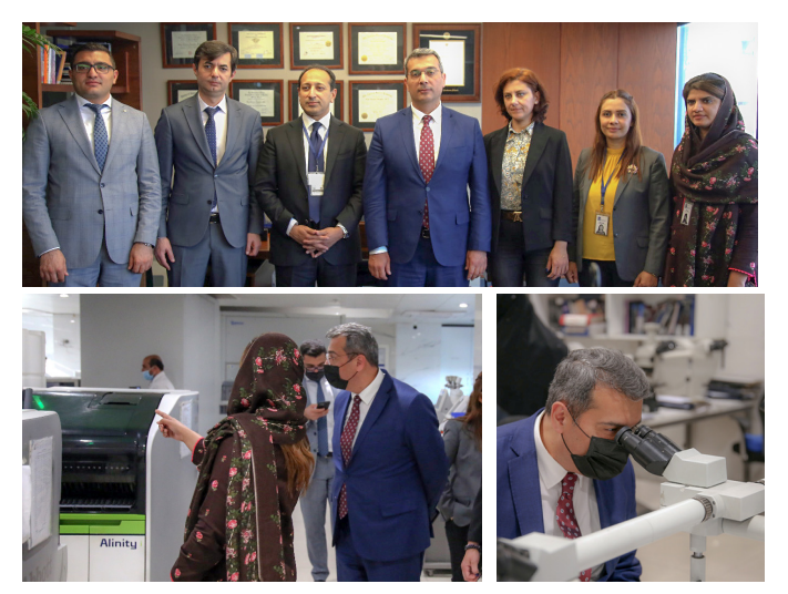
Page 10 | Chughtai Healthcare News

The dignitaries were given a tour of our state-of-the-art facility. They were immensely impressed and appreciated the work Chughtai Healthcare has undertaken to improve healthcare in Pakistan.