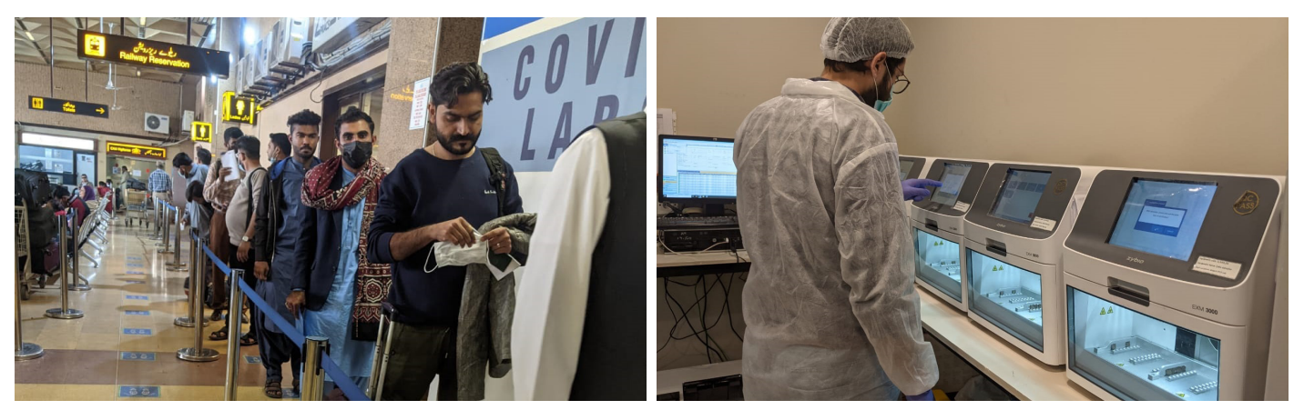
Page 2 | Chughtai Healthcare News

Chughtai Healthcare team set up its rapid COVID-19 PCR testing lab at the airports offering COVID-19 testing facility and report generation within 6 hours. This one window solution proved to be an integral part of the protective travel measures nationwide. We are glad to play our part in helping people travel safely and meet the global healthcare standards for airlines.